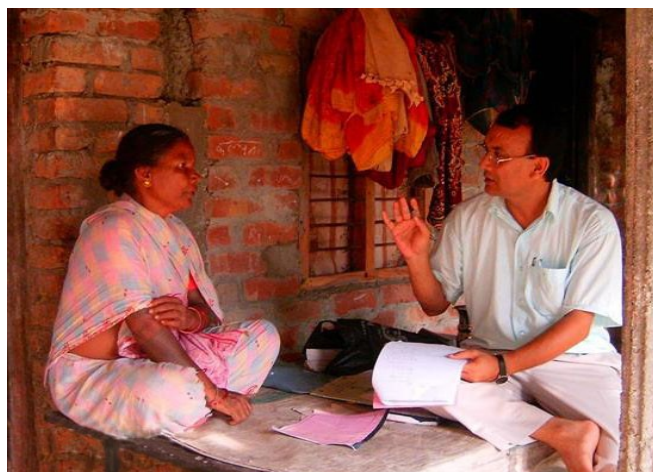
NFHP Field Officer conducting an interview with an FCHV utilizing a checklist.