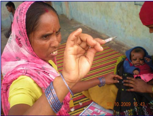
A Female Community Health Volunteer (FCHV) assesses a sick newborn for possible severe bacterial infection. Severe infections are one of the major causes of neonatal deaths in developing countries.