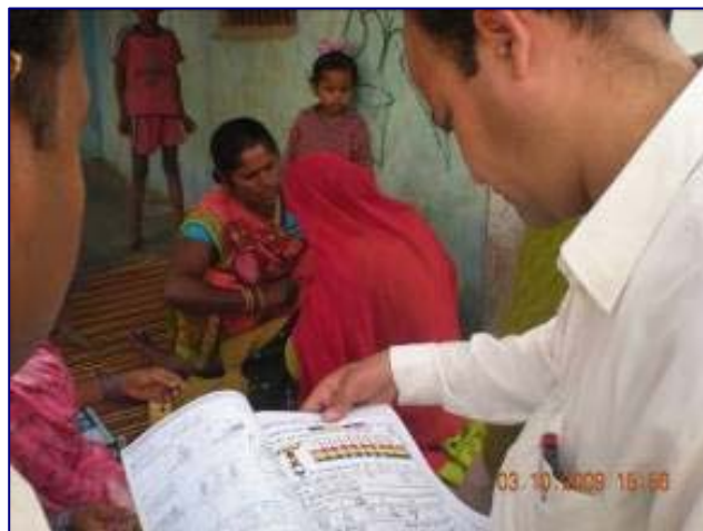
A District Public Health Officer reviews a FCHV register and provides supportive supervision.